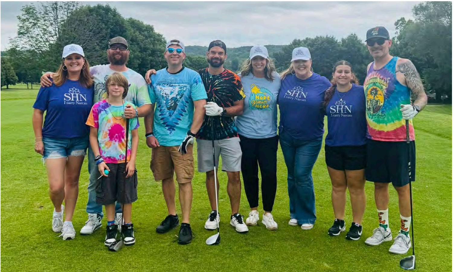
10th Annual Terry Fritz Memorial Golf Outing